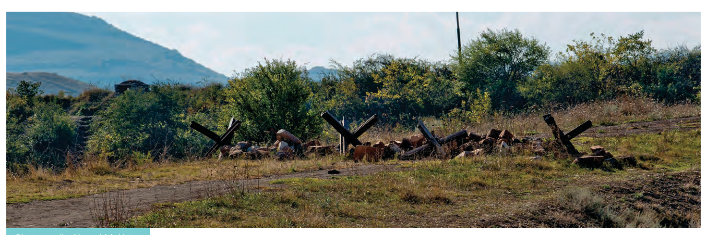
Before the conflict over Nagorno Karabakh, Armenian and Azerbaijani people used this road without any problem. During the Soviet era, a public bus route went from the Azerbaijani village of Agdam to the Armenian village of Gala and back.

For some internally displaced families in Azerbaijan, the reality of live fire at the Line of Contact is one of the main reasons for resisting the government's IDP relocation programme. The aim is to provide those living in substandard conditions with better and more permanent accommodation; however, the properties on offer are situated closer to the frontline.