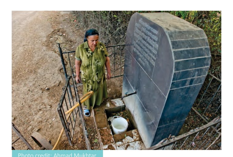
Access to safe drinkable, as well as irrigation, water is a serious issue for many communities, affecting women's work and cross-border natural resource management.

A woman in an IDP settlement in Azerbaijan explained how water availability constrained her ability to grow crops. Irrigation water was limited through a metered allowance, and households had to buy drinking water from tanks. Plants did not grow well in the dry soil, and she lamented that the soil was richer back in Agdam.