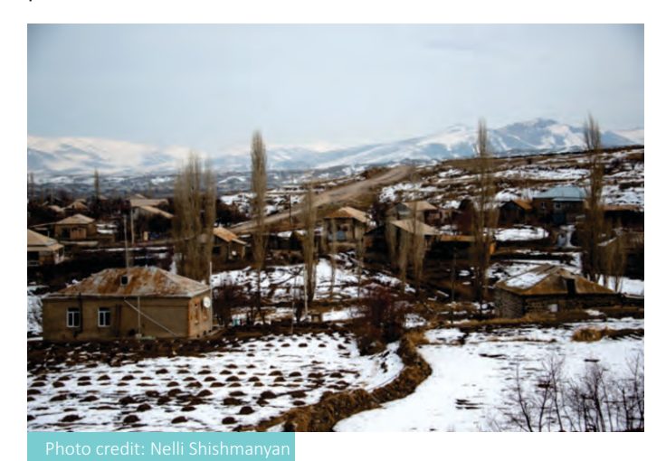
The diversion of high military expenditure from sectors such as employment, education, and housing were evident. The image shows precarious housing conditions in Khachaghbyur village (called Chakhrlu in Azerbaijan) in winter.

In terms of trade, for example, conflict resolution and the opening of the Armenian-Azerbaijani border would restore traditional trade patterns and greatly benefit the impoverished population living along the borders. The diversion of high military expenditure from sectors such as employment, education, and housing were evident in our data collection, reflecting the issues women prioritised in our interviews.