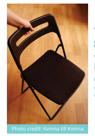
"If they don't give you a seat at the table, bring a folding chair" - Shirley Chisholm, politician, educator, and author.

meetings and more direct dialogue across borders. Women activists require support to implement their creative approaches that enhance women's meaningful participation in peace processes, going beyond established networks and practices.